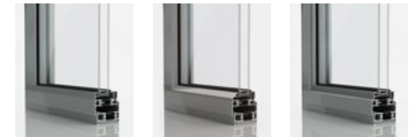
➤ Flat Line ➤ Putty Line ➤ Stepped Edge

AluK (GB) Limited Newhouse Farm Ind Est Chepstow NP16 6UD +44 (0)1291 639 739